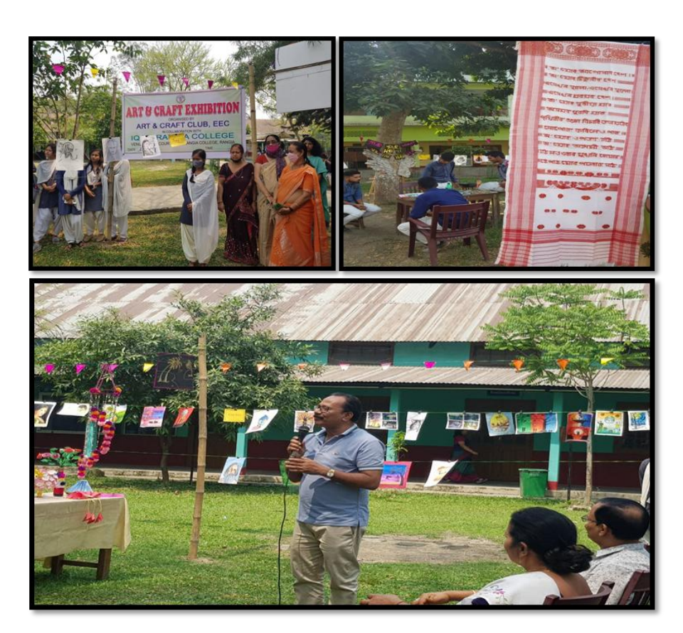
Art & Craft Exhibition organized by Art & Craft Club, EEC