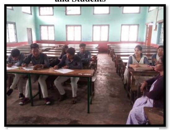
Art & Craft Club