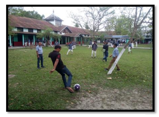
Sports Club-Match between Staff and Students