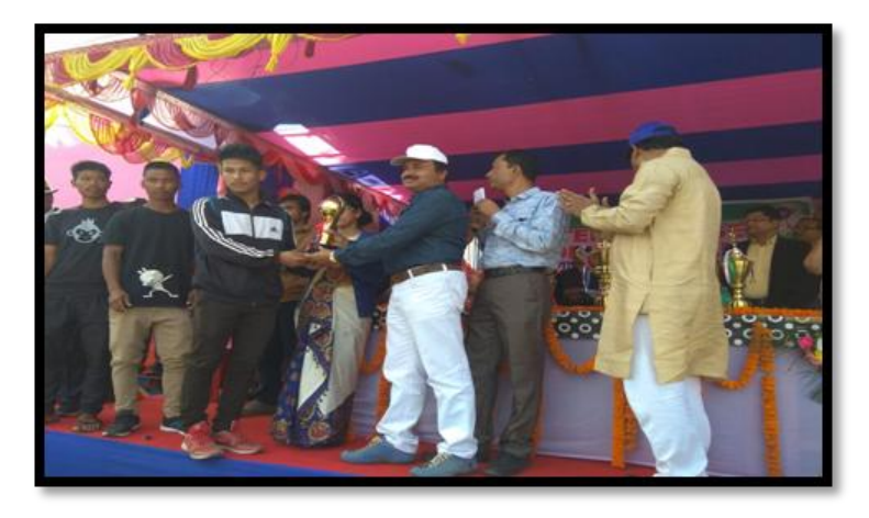
Rangia College boys Kabaddi Team won the best team Award in Inter college Kabaddi tournament 2018-19