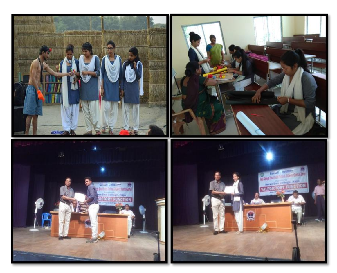
Art and Craft Club: Prize winners at the Inter-college Zonal Youth Festival, 2018-19, held at Suren Das College, Hajo, Kamrup.