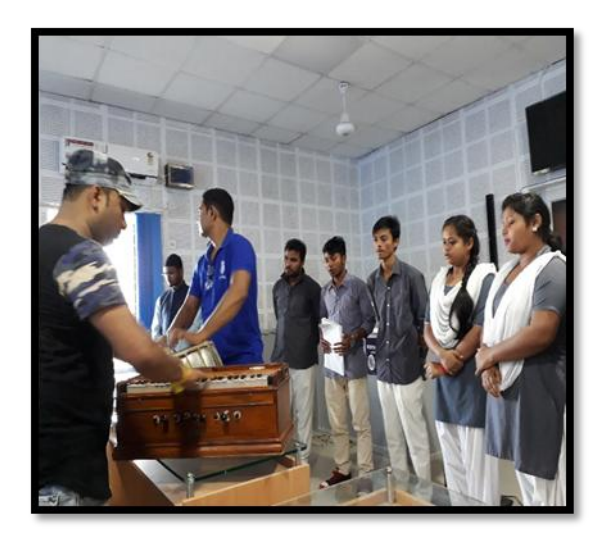
Workshop on Singing Techniques- Music Club Chorus by Music Club on