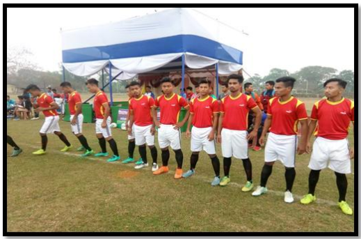
Rangia College Sports Club participating in Inter college footbal Tournament