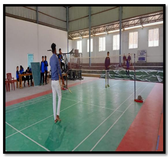
Badminton Tournament organized by Department of Physical Education & Sports Club on Indoor Stadium