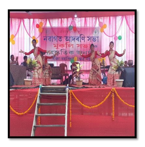
Dance Club Students Performing on Freshers'Day

Our Club students also did us proud by winning a number of awards in the Inter-College Zonal Youth Festival, 2019 held at Suren Das College, Hajo.