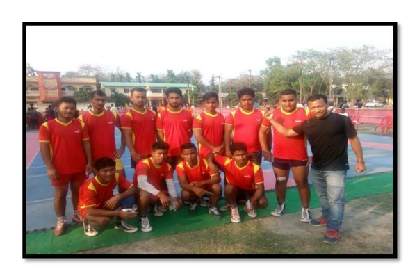
Rangia College sports club in G.U. Inter-College Kabbadi and Archery tournament